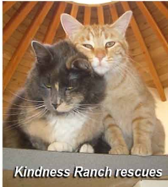
Kindness Ranch rescues