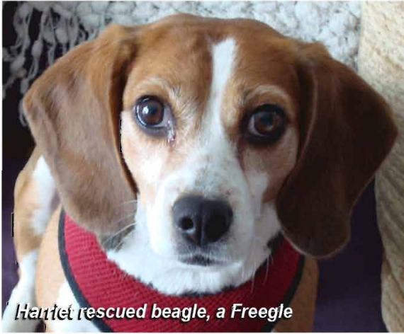
Hariet rescued beagle, a Freegle